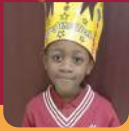
Islara PRE KG B