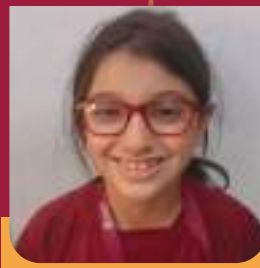
NIL Grade 2A