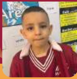
Amer KG 2B